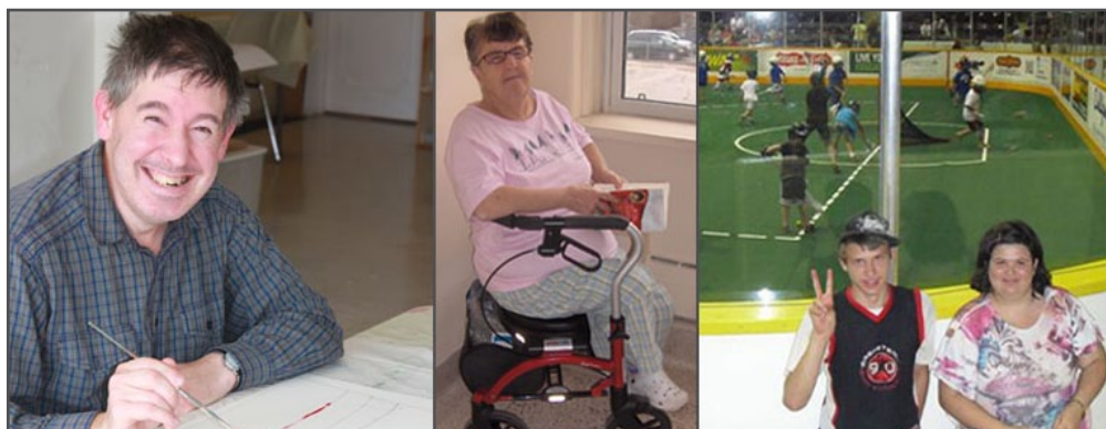
Community Living Peterborough's Wish Fund has granted wishes to take art classes with local professionals, purchase new walkers and other important assistive devices, and to attend sports events like the Lakers Lacrosse games

This is where the Wish Fund comes in. We encourage people we support to take pride in their accomplishments and in turn we can assist them with any extraordinary expenses that will allow them to achieve their goals. The Wish Fund is not a supplement or income; it is an opportunity to ensure personal goals are met through planning and applying to the Fund. Past wishes have included assistance to purchase dentures, orthotics, sports tickets, vacations and trips to the Special Olympics, as well as